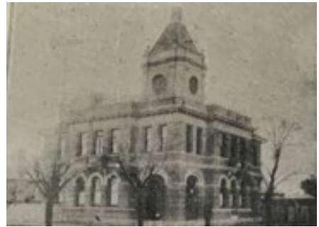
Old Post Office, built 1870